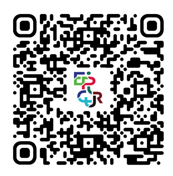
SCAN ME TO VISIT EPICUR'S WEBSITE AND GET ACCESS TO ALL THE CONTENT ABOUT INTERCULTURALITY

We would like to thank all those who provided us with their testimonies on intercultural competences. Their diverse experiences and perspectives as students, alumni, staff or professionals helped to define intercultural competences, their relevance and usefulness in the work environment but not only. Intercultural skills are indeed the gateway to dialogue, tolerance and inclusion - all of which are essential to a more open and tolerant world.