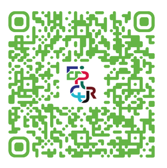
SCAN ME TO CHECK OUT ALL THE ANSWERS TO QUESTION 2 ON YOUTUBE

mtercultural competences are both natural and acquired: we all have them in us to different extents, but above all they are something to be worked on. They are acquired through our encounters and our professional experiences. It is something that is developed and reworked over time and that we never stop learning. For example, I developed my ability to adapt by going on an Erasmus stay abroad, then by doing my first professional internship in a German-speaking environment, but also during an internship at a Parisian foundation. The language aspect was not present in the last case but being in a new context still allowed me to develop these skills.